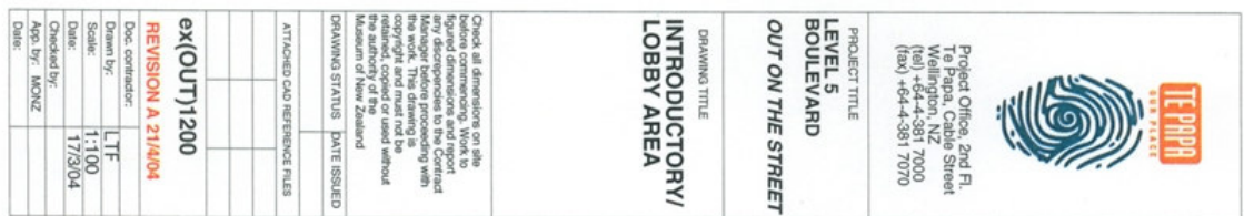
Figure 10: Introductory area Out on the Street